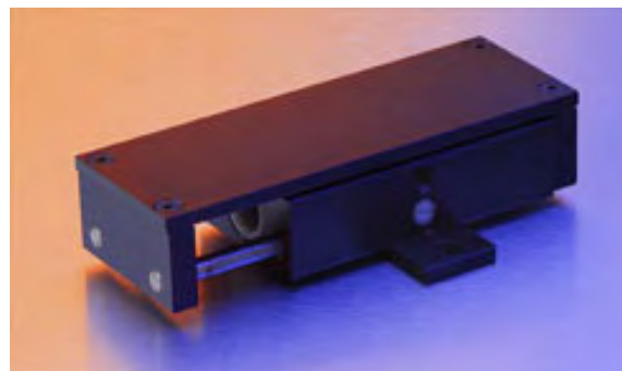
The Vibro Model 250 Air Transporter